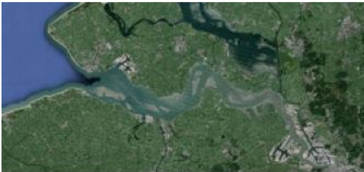
Figure 1. The Western Scheldt with many tidal flats is the main shipping route to the port of Antwerp (right lower corner). The depth of the main shipping channel is maintained by dredging. Part of this dredged material is then replaced to the tidal flats in order to enhance the natural value of the system.

To maintain the depth of the channels for transport to the Port of Antwerp, annually 11.6 Mm 3 is dredged from the main channels of the Scheldt Estuary. The material is then re-placed within the estuary on the edges of tidal flats, in smaller channels or in other locations of the main channels. The replacements on the tidal flats help to supply sediment to the mudflats and salt marshes in the Estuary. Natural processes (tides, currents, sediment transport) distribute the sediment to intertidal areas. By