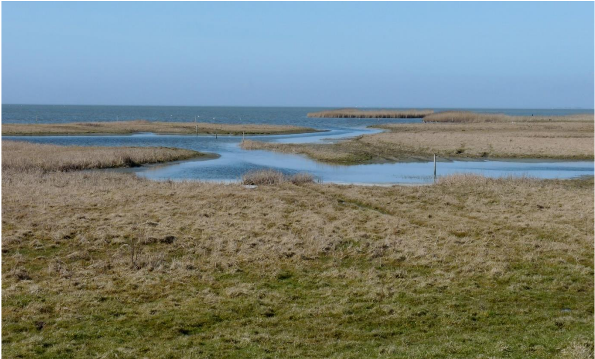
Figure 2. The natural foreshore in Lake IJssel, protecting the dikes against high wave action. The dredged material of nearby harbour maintenance was used.

The dredged material is not disposed as a waste, but it is used as a resource. Instead of relying only on a hard engineering solution, the natural functions of the foreshore (a buffer against wave energy and a sink for carbon) are being restored.