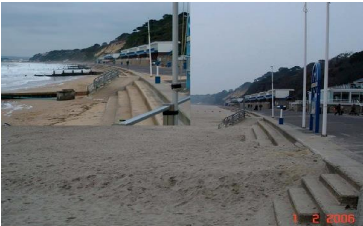
Figure 3. Before and after: beach nourishment using dredged sediment from the deepening of the navigation channel in Poole Harbor

Dredging and disposal of sediment poses some unique challenges in the ecologically protected Norfolk Broads. This multi-objective project provides a win-win solution: using dredged material beneficially solving a river bank erosion problem helping to restore 7,000m 3 of reed-bed, a declining, nationally important habitat. Dredged material was retained within four geotextile bags filled with solid sediment using a concrete pump, underwater. The bags were planted with locally-sourced reed (Brooke, 2013).